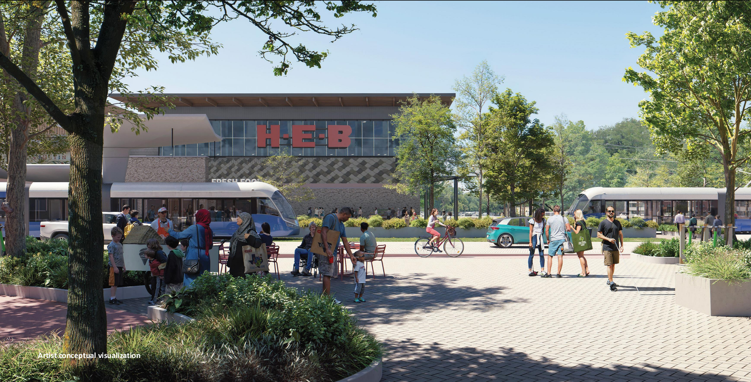
Artist conceptual visualization