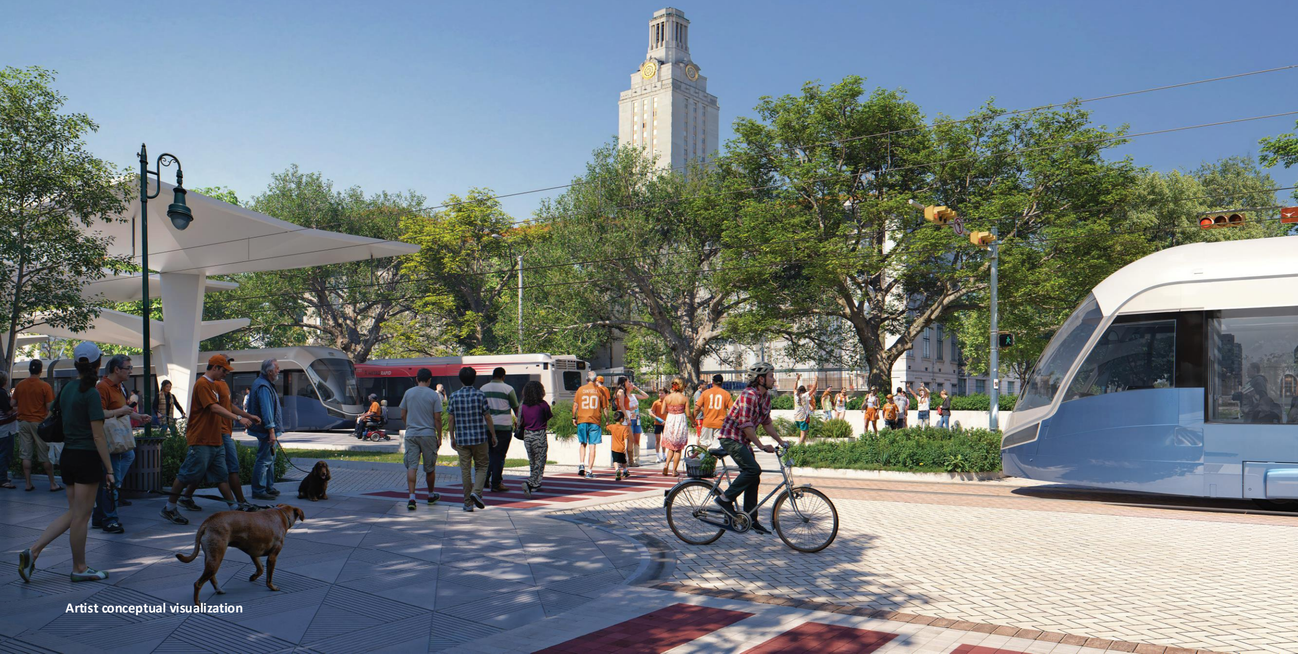
Artist conceptual visualization