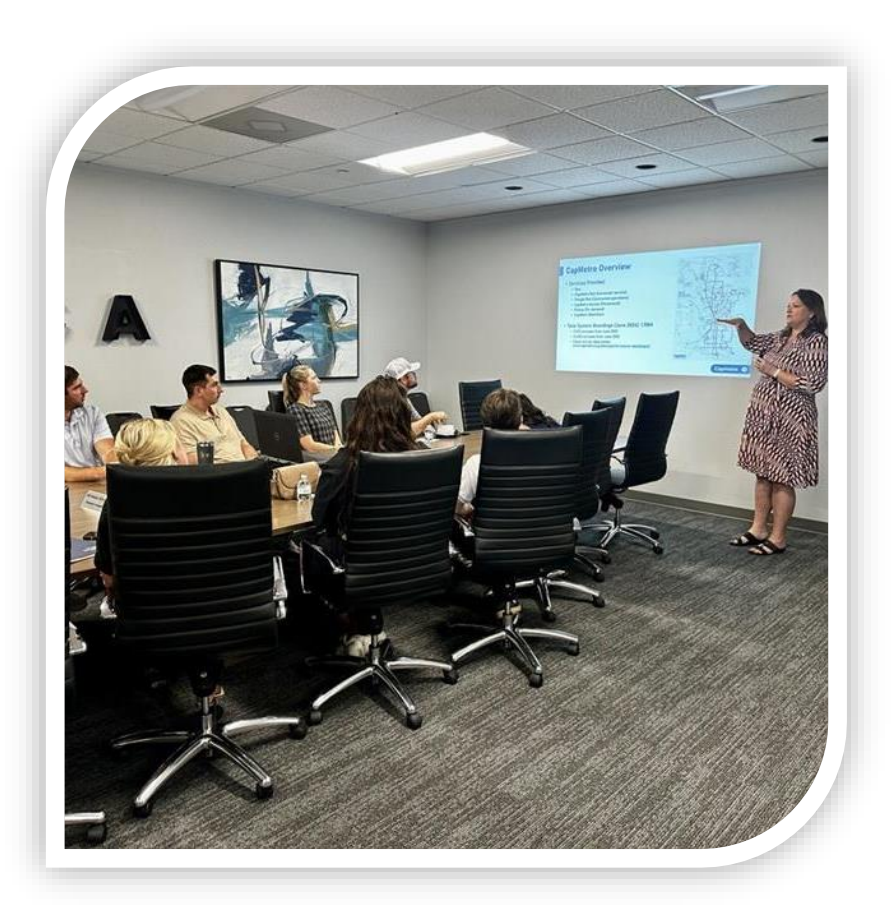
RECA Leadership Development Council