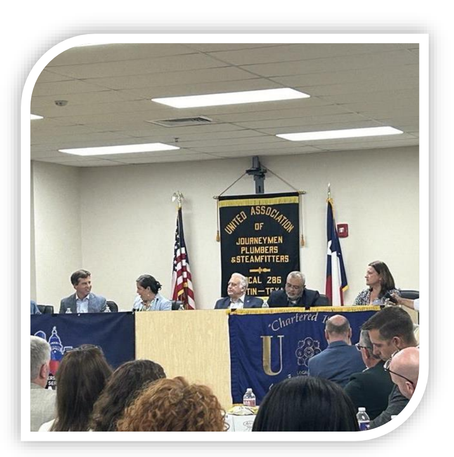
Project Connect Annual Update