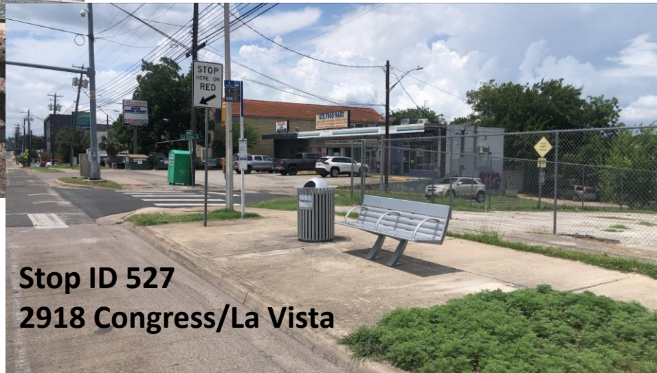
Stop ID 527 2918 Congress/La Vista