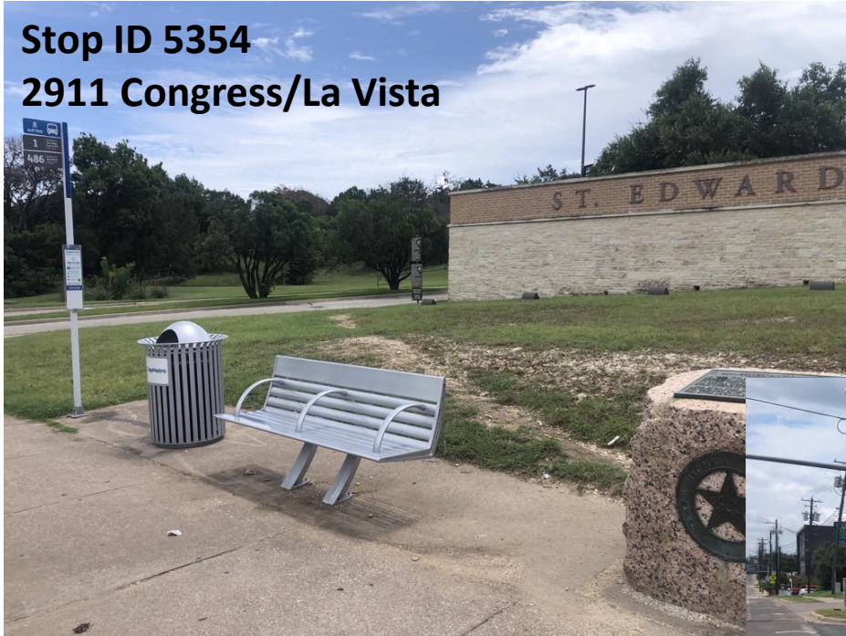
Stop ID 5354 2911 Congress/La Vista

Austin Backed Bench, Cantilever, Aluminum, End Arms and Center Arm