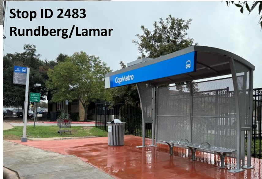
Stop ID 2483 Rundberg/Lamar