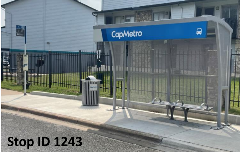
Stop ID 1243 Burton/Mariposa

Austin Backless Bench, Cantilever, Aluminum, End Arms and Center Arm